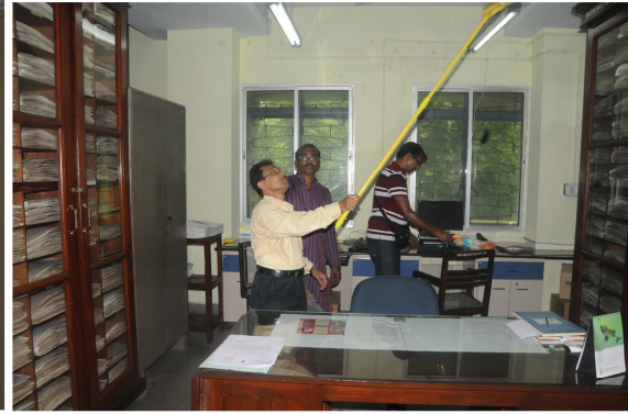
Cleaning work undertaken in Hall 4