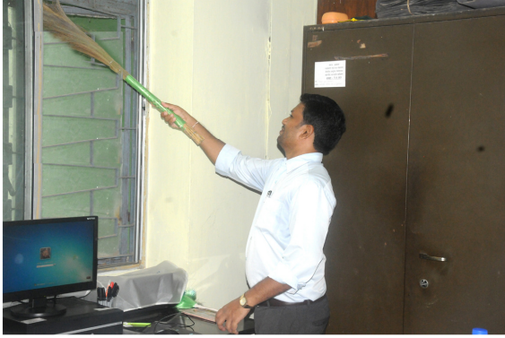
Cleaning work undertaken in Hall 2