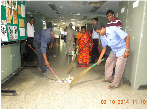
Cleaning work undertaken in Hall 5 of CNH