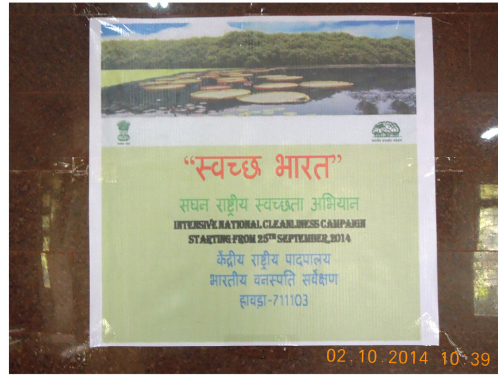
'Swachh Bharat' poster inside CNH building