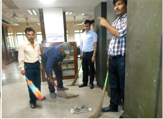
Cleaning work undertaken in Cryptogamic Unit