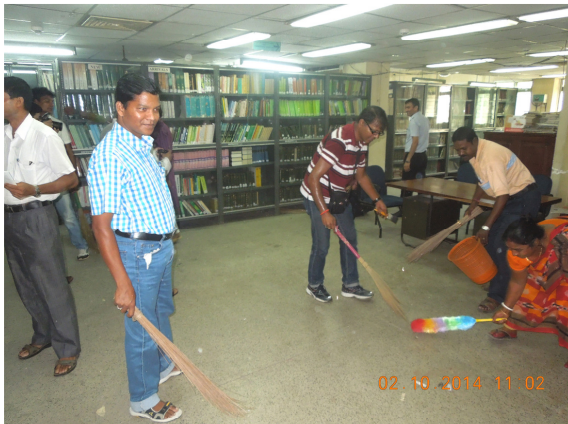
Cleaning work undertaken in Central Library of BSI