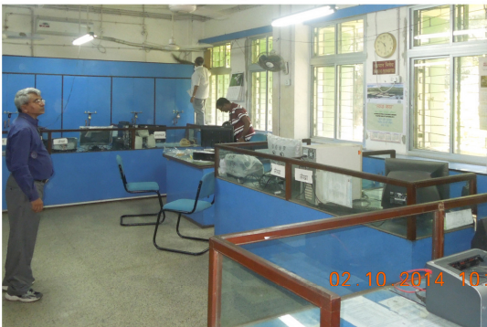
Cleaning work undertaken in CNH Office