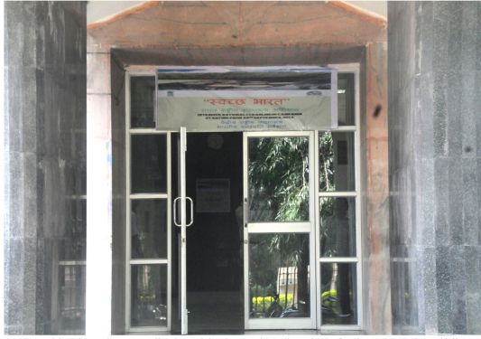
'Swachh Bharat' poster displayed in Central National Herbarium (CNH) Building gate, Botanical Survey of India, Howrah