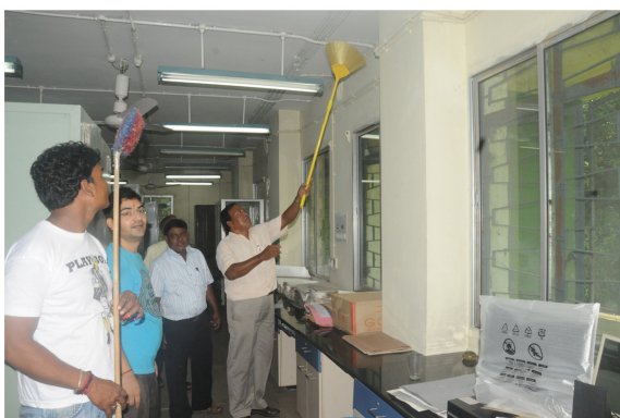
Cleaning work undertaken in Hall 1