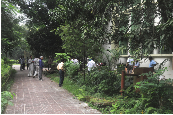
Cleaning work undertaken surrounding CNH Building