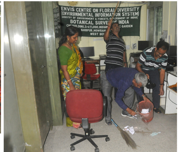
Cleaning work undertaken in ENVIS Centre of BSI