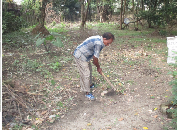
Cleaning work undertaken in BSI Land situated at 191, Andul Road & 77 D.S. Lane