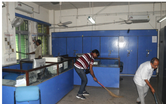
Cleaning work undertaken in CNH Office